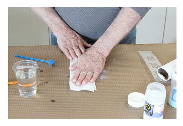
6. Wipe off any excess powder on the mold surface.

5. Pat dry with a paper towel to remove excess surface water - but only on the surface.