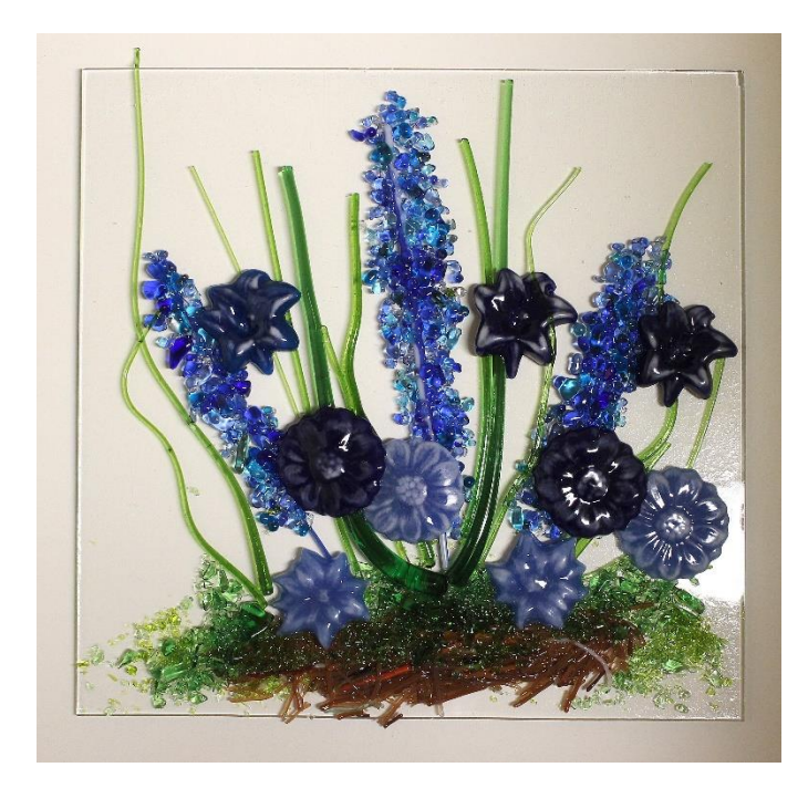
Some Other Glass Gardens Draped over a steel sconce mold.