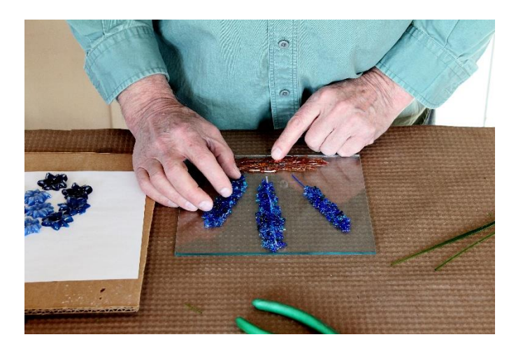
Set out assorted green stringers and vitribulbs as grass and leaves in background for your garden.

Apply 3 glass fronds. I'm using 3 for this project but you can experiment with less and more for different looks.